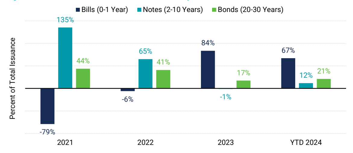
Figure 4 | Short-Term Debt Has Dominated Treasury Issuance Since the Yield Curve Inverted